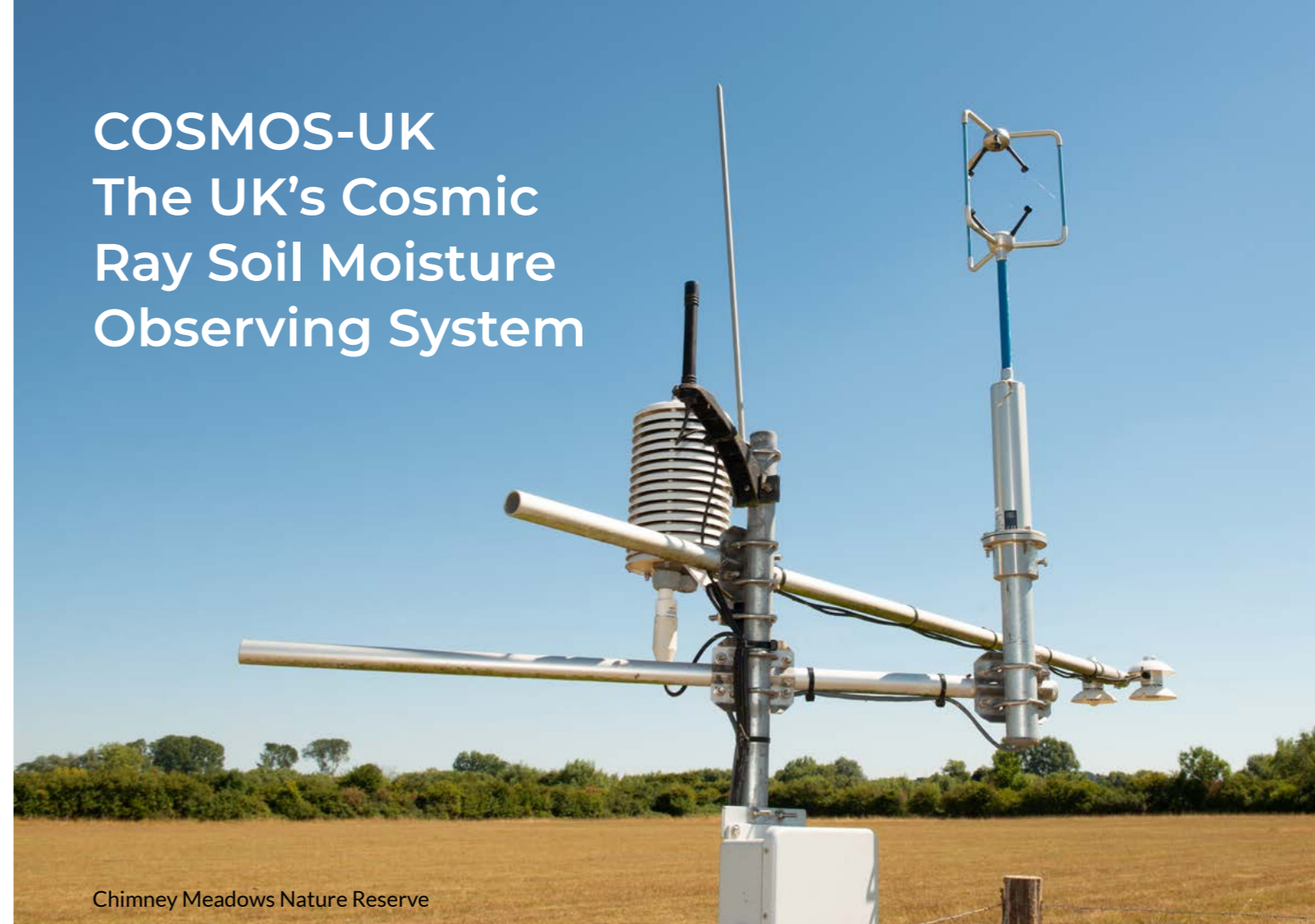
Chimney Meadows Nature Reserve

Soil moisture refers to the water that is held in the spaces between soil particles. It is an important component of the water cycle, at the local field scale, for regional water resource availability, and for large-scale hydroclimate modelling and understanding of controls on soil functioning, such as greenhouse gas emissions affecting the whole climate system. The availability of soil water for evapotranspiration controls the partitioning of land surface energy fluxes – very dry soils increase convective heating of the air, and this information is vital for weather and climate modelling. Soil moisture status varies greatly with soil type, climate, drainage, vegetation and land management practices.